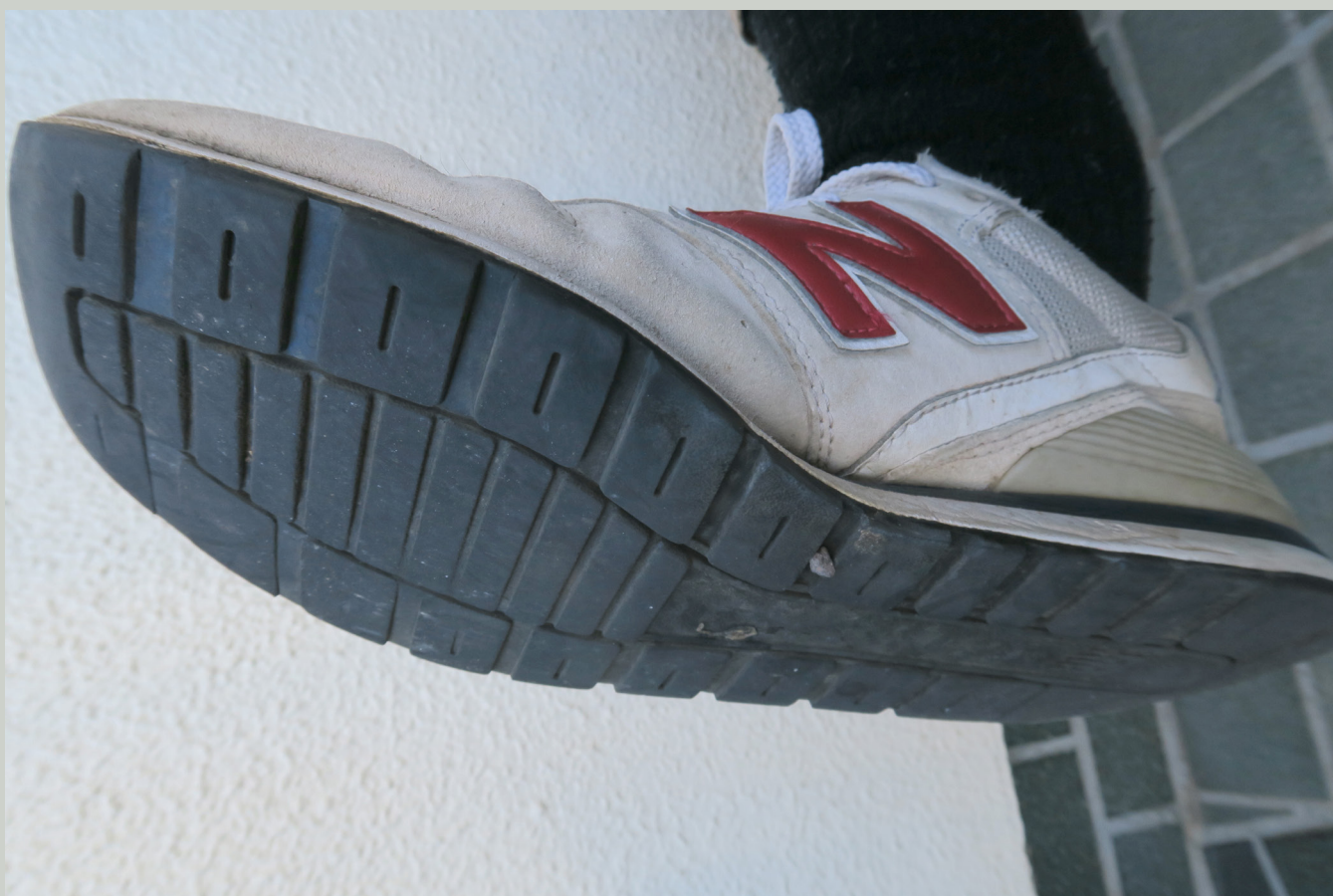
Stefan Klein - From the Collection: Some Rocks, 2018 - ongoing, Sculpture, rocks, intervention, collection