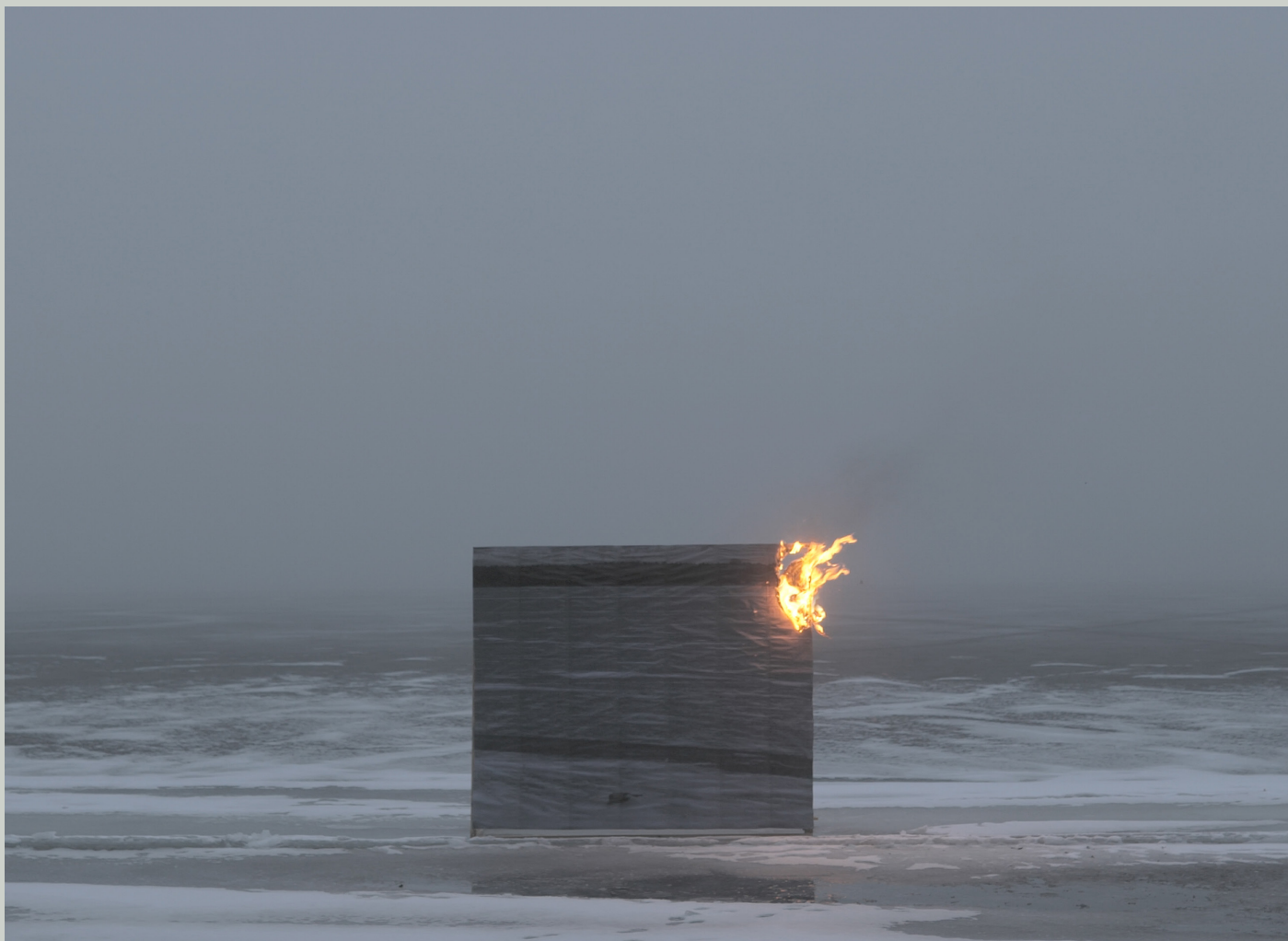
Betty Böhm - Trying to burn the past, 2026, Video Still, 4K Video Loop © Betty Böhm