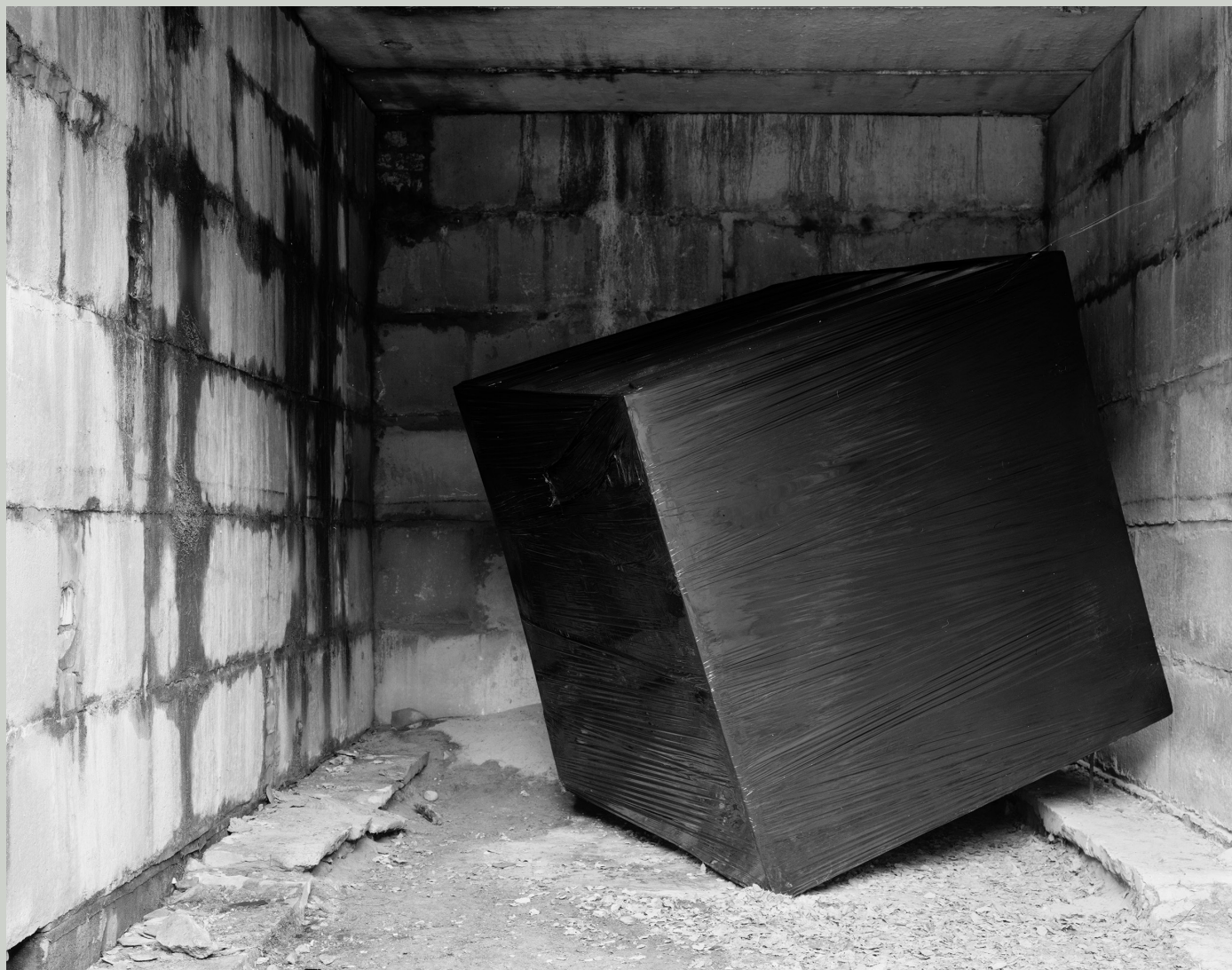
Claire Laude - Corps Noir, 2018, s/w Fotografie, 80 x 100 cm, Photo: © Claire Laude and VG Bild-Kunst, Bonn