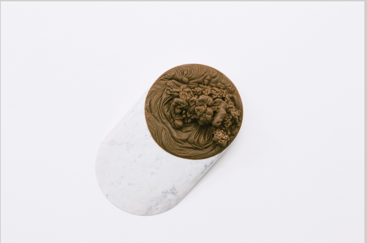
Attilio Tono - MW13, 2016, Carrara marble, beeswax, 60 x 35 x 18 cm