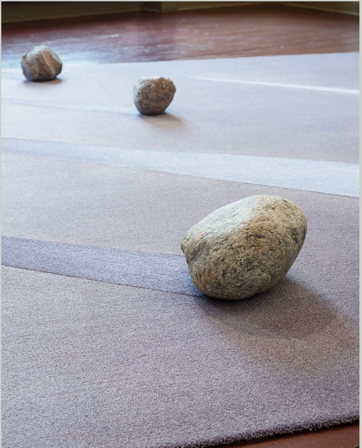
Catherine Rose Evans - Gravity Blanket, 2023, found glacial erratics, carpet, 350 x 300 cm, Photo: © Catherine Rose Evans and VG Bild-Kunst, Bonn