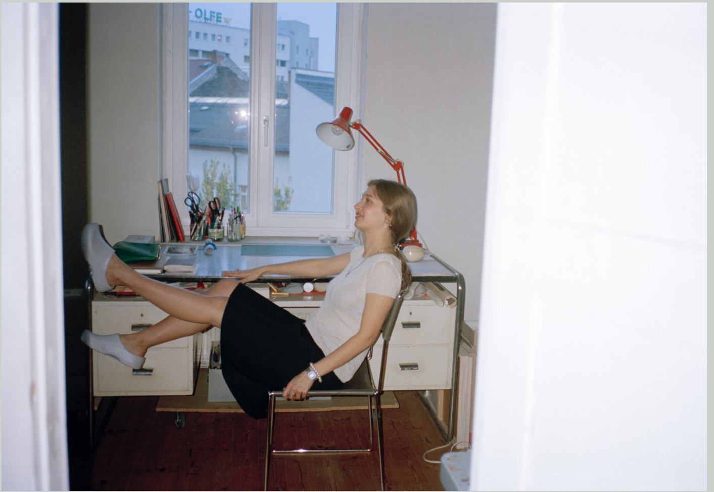
Olga Hohmann, Photo: © Courtesy