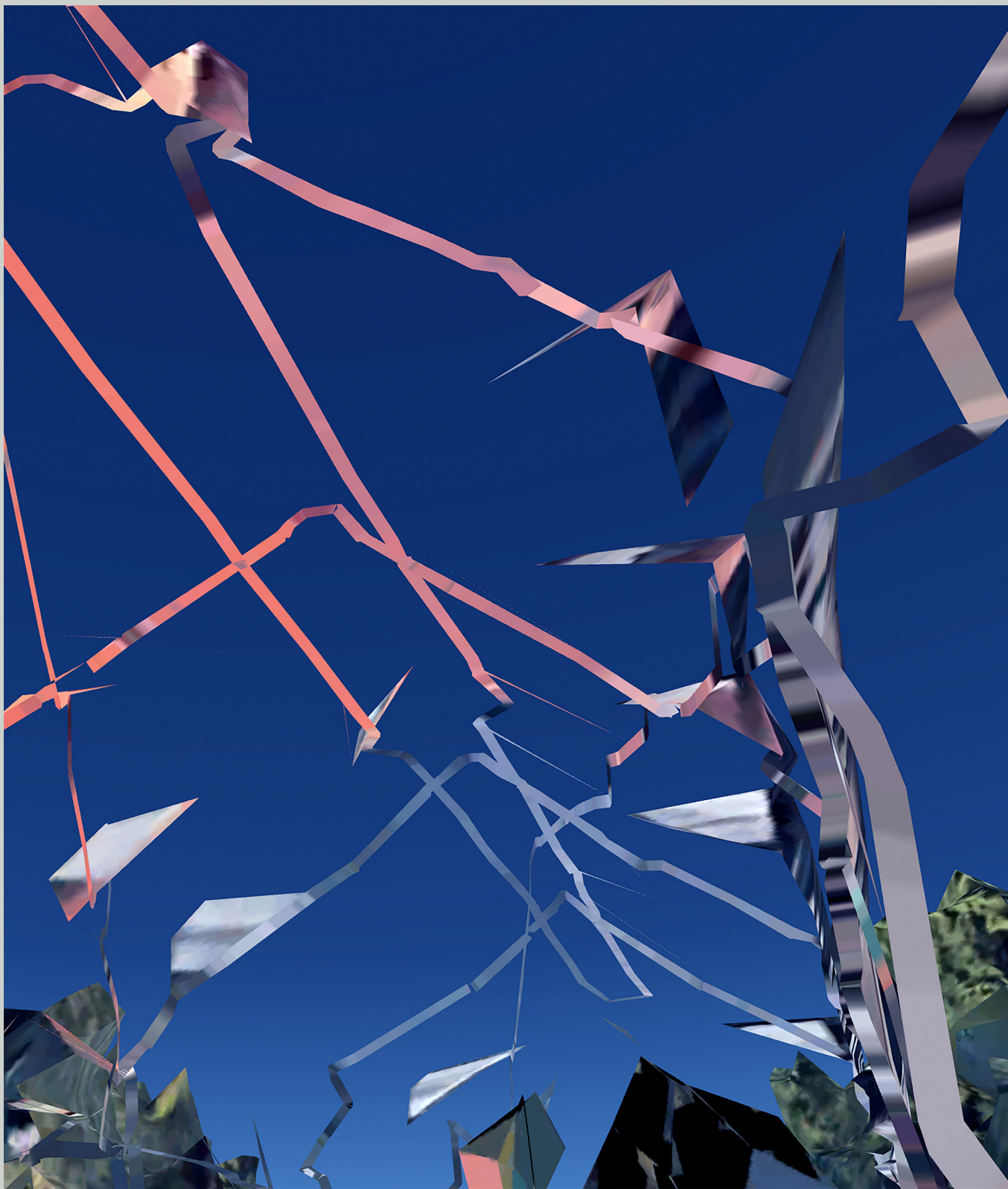
Kathrin Ganser - Marian (Mariannenplatz #7), 2019, Fine Art Print on Hahnemühle Photo Rag Baryta, Distance Frame, 102,5 x 87,5 x 3,5 cm, Photo: © Kathrin Ganser and VG Bild-Kunst, Bonn