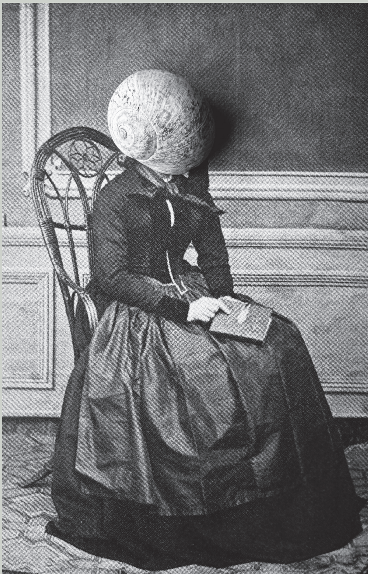
Dana Engfer - Hnattferðir (Lesende), 2025, Photo Print on Chiffon, 199 x 128 cm