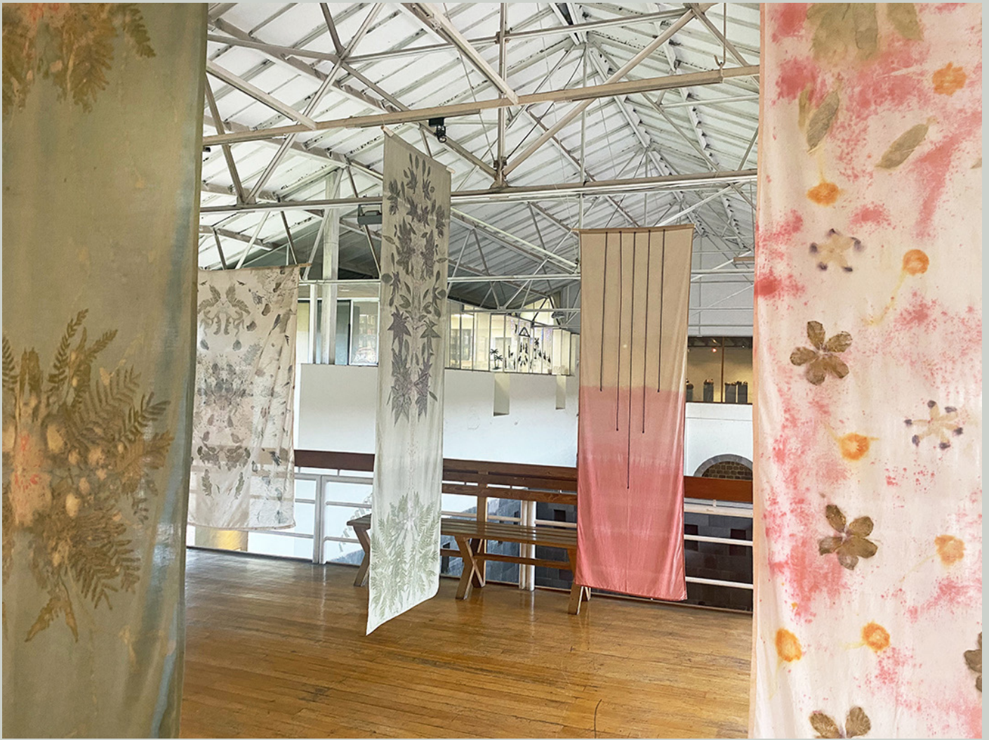
Carla Mercedes Hihn - Impressionen des Waldes, 2025, ecoprint on silk-cotton blend fabric , 220 x 70 cm, Installation View: Museum Qorikancha, Cusco, 2026