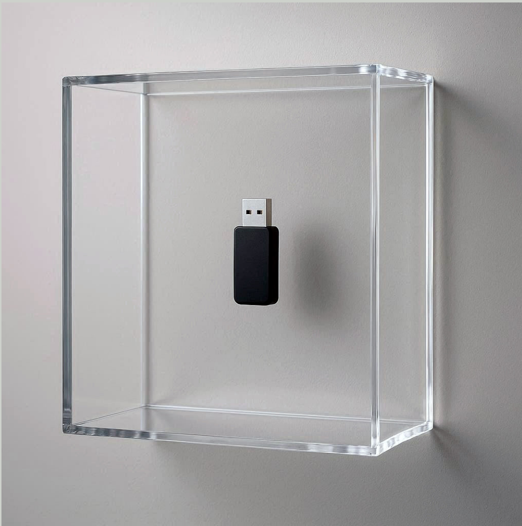
Sarah Straßmann - Digital Relicts, 2026 - ongoing, 3 x storage media (CD Rom, USB Stick, iPhone 4), Plexiglass